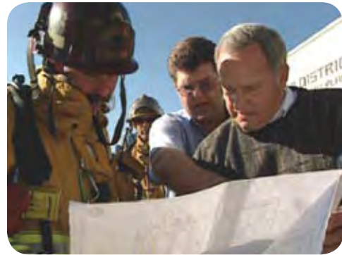
Produced by AWWA, 2003, DVD, 15 min. ISBN 1583217150

No. 64268 | Nonmember $295 | Member Price $195